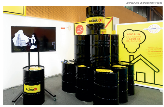
Information campaign 'Goodbye to oil' to replace oil heating systems in Austria.